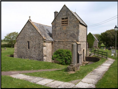
St Bridget's, Brean