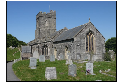
St Mary's, Berrow