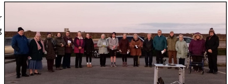
Berrow Sunrise Service

"Go therefore and make disciples of all nations" (Matthew 28:19)