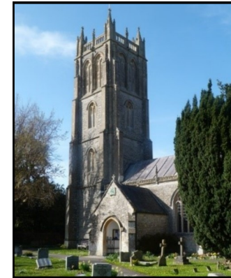
St Christopher's, Lymsham