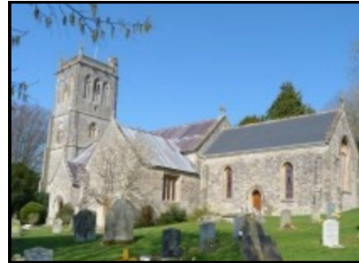
St Michael's, Brent Knoll