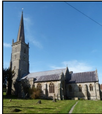
St Mary's, East Brent