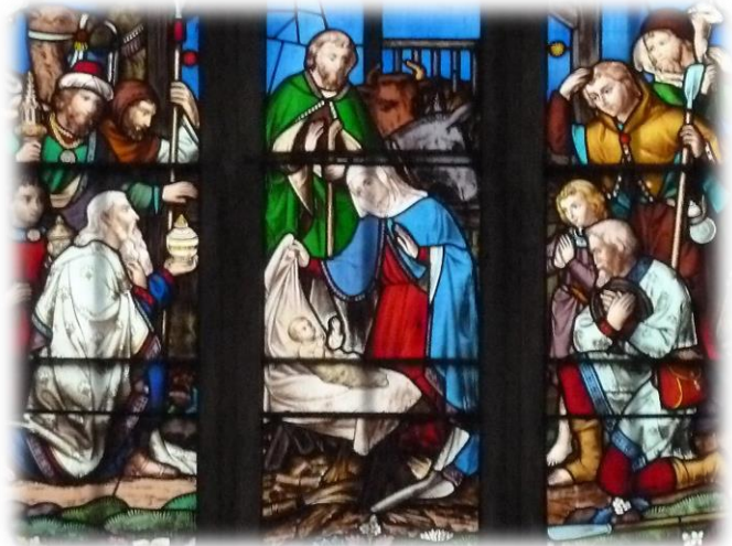
Pilton church window