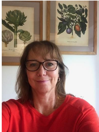
Charlotte at Pylle