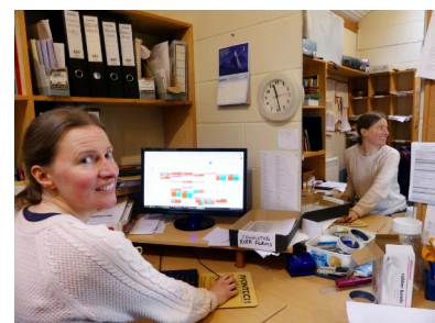
the Parish Office