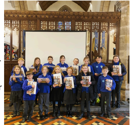
Pupil Chaplains 2024

Pupil Chaplains - We started the Pupil Chaplaincy program in 2022 with 10 chaplains, who meet weekly for lunchtime Bible study. We are now on our third team. The pupil chaplaincy program has been selected as a Learning Hub by the Growing Faith Foundation, so our work will intensify next year as we plan to write a handbook curriculum based on our work to provide an easy resource for other parishes wanting to start their own chaplaincy programs.