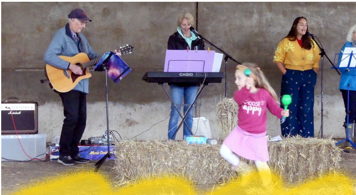
Harvest Festival at the farm

Our vision is to love God, love our neighbours and encourage discipleship as we seek to extend the Kingdom of God.