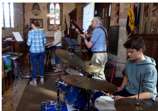
The Worship Band

The current pattern of services can be found at https://www.backwellchelveybenefice.org.uk/worship/sundays/ and we live-stream two to three services a month.