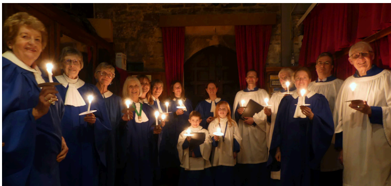
Choir after the Carol Service