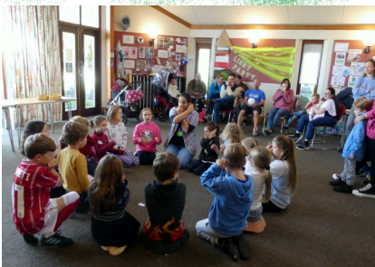
Light Party in Church House Good Friday, Singing Carols outside SPAR, Ringing room