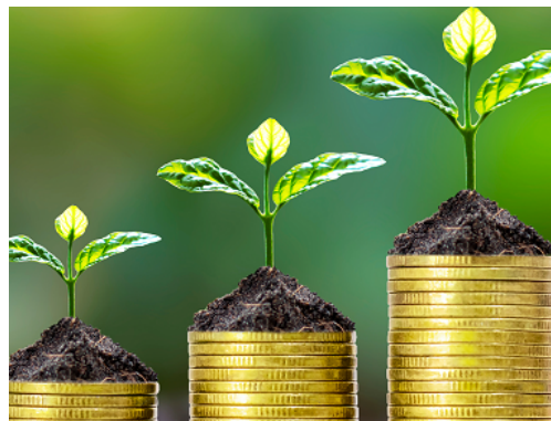
Church Money Matters