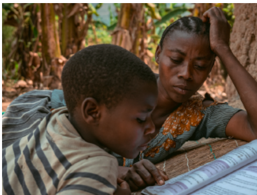
Ripple Effect Christmas

We are now registering for 2025. Find out more about the course and register online.