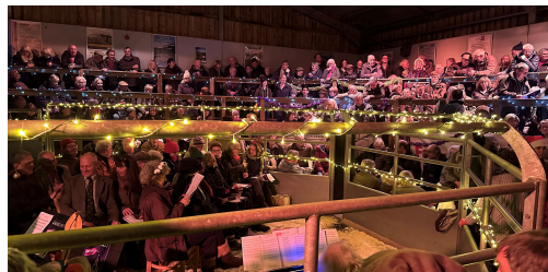
Singing in the Ring service at Exmoor livestock market.