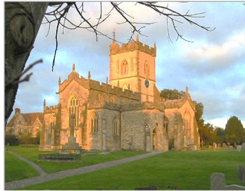
St Mary Magdalene, Ditcheat