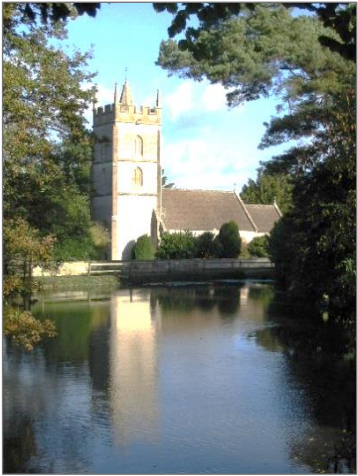
St Thomas A Becket, Pylle