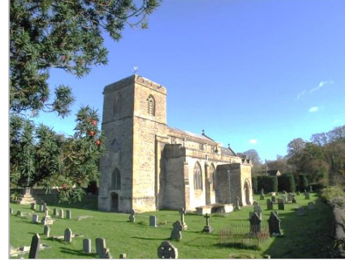
All Saints' East Pennard