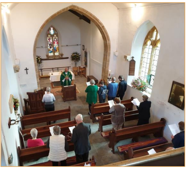
2020's Harvest Festival at Seavington St Michael.