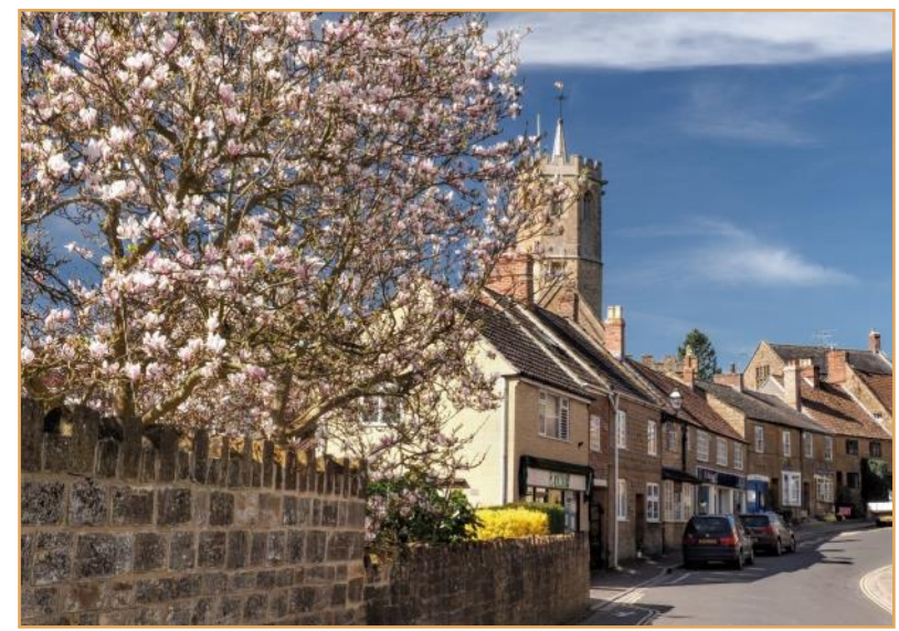
St James's Street, South Petherton.

The nearest town you may have heard of is Yeovil (nine miles away), which has most of the major supermarkets and two railway stations. Crewkerne, five miles to the south, has two supermarkets and a lovely warm swimming pool and gym, plus another railway station which runs regular trains to London and Exeter.