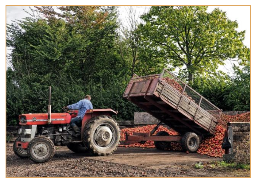
Bringing in the apple harvest.

You may notice that we talk about roads: you need to be aware that public transport is very limited, so you will need access to a car to be able to get about the benefice. A certain careful recklessness about single-track roads would be an advantage.