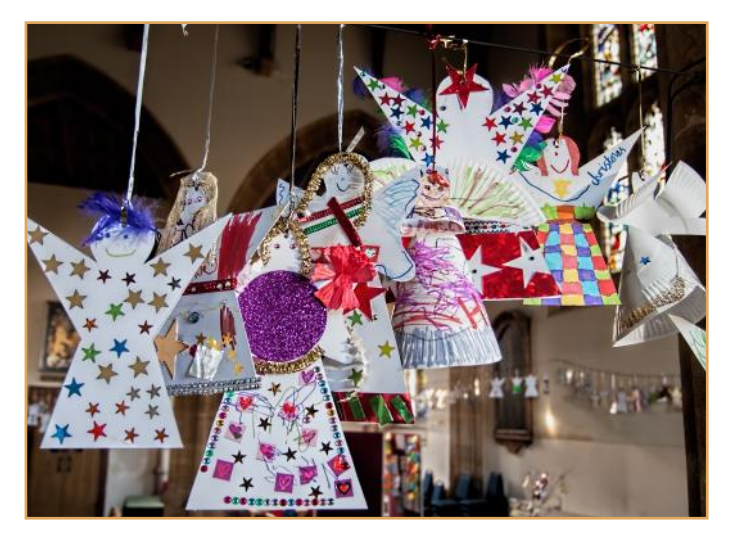
Top : A priest's-eye-view of our Christingle Service. Above : Part of our host of angels.

Advent and Christmas are wonderful. The Infants School decorates our Christmas tree, and holds its Nativity Play here. In the recent years, we have started to adorn our church at Christmas with decorations made by local children and adults. We have a massive craft session running the afternoon that the Christmas lights are switched on, and the church is happily covered with sequins and crayons for the afternoon. In 2019 more than 100 children joined in that day, and we ended up with 250 decorations. We host the South Petherton Combined Arts Choir's carol concert, which for many local people signals the start of Christmas. The Christmas services are very well attended. There is standing-room only at the Christingle service, and the 'Carols by Candlelight' is also extremely popular.