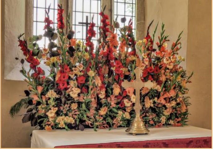
The church decorated for the Flower Festival.