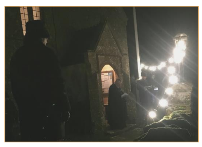
The Christmas Eve service, 2020.

My family moved from Yeovil in 1967, finally settling in East Lambrook in 1974. On leaving school I started work at East Lambrook Manor Gardens, eventually as head gardener. This cottage garden is the creation of Margery Fish. Its dense and natural planting makes a wonderful habitat for wildlife and is a constant reminder of the wonder of God's creation. I joined the congregation at St James about 2012, soon helping out with bell ringing and stepping in when we are without an organist though using only one finger, just sufficient to keep us together and in tune! I also arrange for the maintenance of our churchyard. As deputy churchwarden I have helped prepare for the various services in all their diversity, from the candlelit Carol service when the villagers fill St James and carols ring out across the dark fields, to the peace and beauty of the service of Compline during Lent. When time allows, I love to explore our surrounding countryside, especially the Levels with its distinctive and ancient landscape – though I've yet to try the smoked eels once farmed by the monks of nearby Muchelney Abbey.