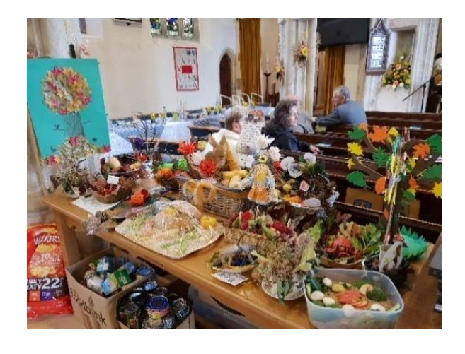
Preparations for the Harvest lunch, and collection of donations for the Food Bank.