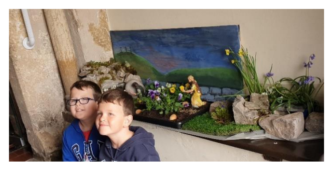
Easter Garden in porch, made by these two younger members of the congregation.