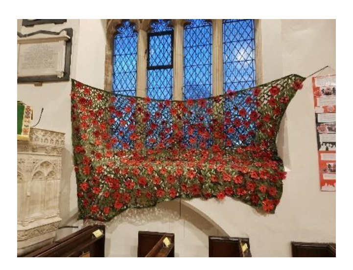
Poppy display made by school children