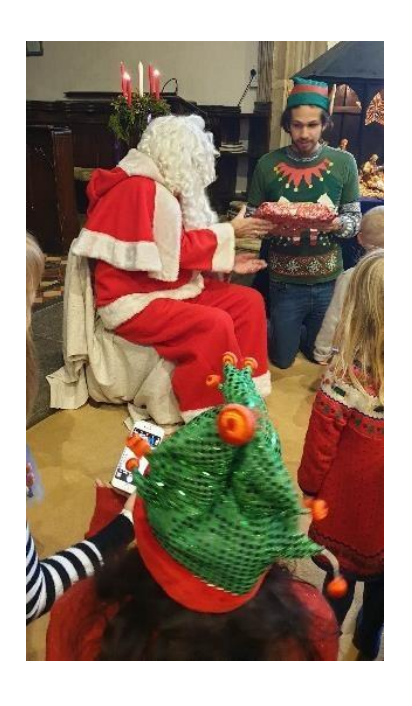
Father Christmas visits Toddler Group