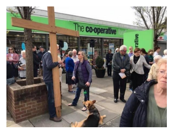
Joining with other Churches for Good Friday outside the Co-Op in Worle High Street

St Martin's Church is at the historic centre of Worle on the hillside. It is mentioned in the Domesday Book and was built in the 12th century, and extended in the 19<sup>th.</sup> It is known particularly by historians, for the Norman font and the 15<sup>th</sup> century stone pulpit carved in stone, symbol of "the Cup of Blessing." The High Street is just below the Church and is a thriving mixture of shops, hairdressers, Estate Agents, takeaways and Cafes. The Community and the British Legion is proud of the War Memorial on the High Street next to the path leading down from the Church and