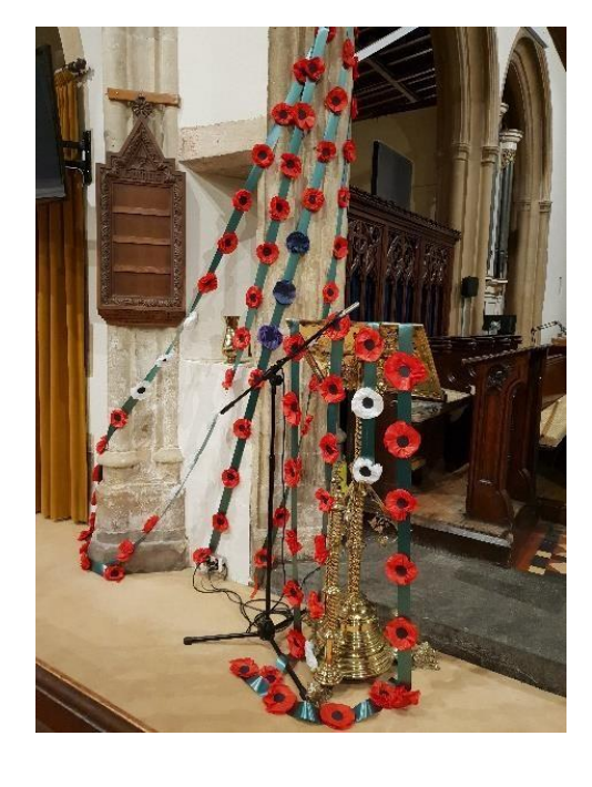
Poppies made by those attending the Wednesday afternoon Cafe