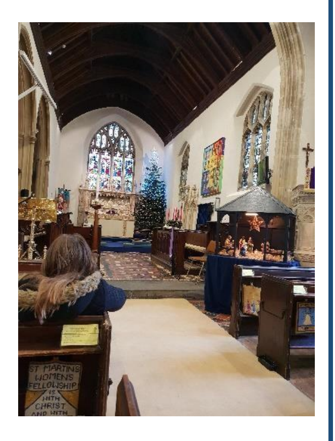
Church decorated for Christmas, showing the Crib