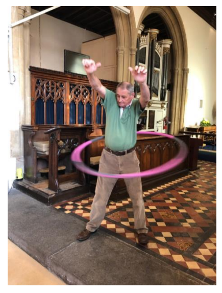
"Spiritual challenges can be compared to learning to use the hula hoop or any other activity that requires intentional practice"