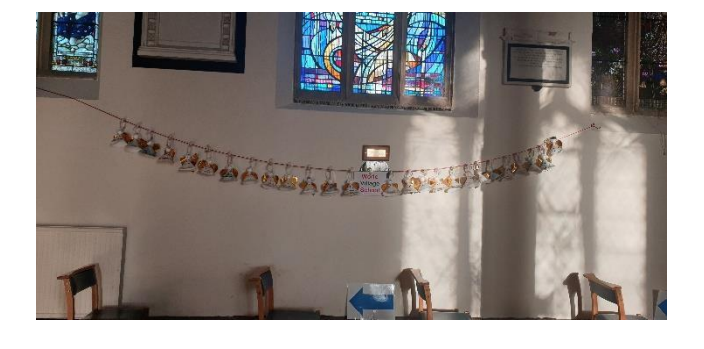
"Angels" made by children from Worle Village School, hung in Church to look over us during these difficult times of Pandemic