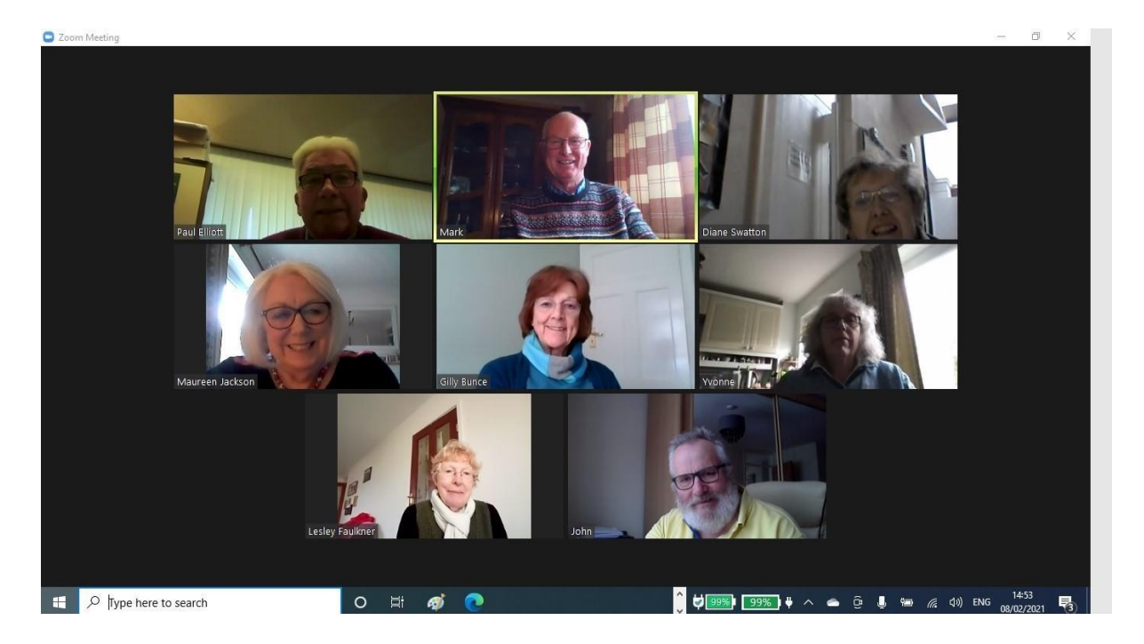
Zoom PCC Meeting - screen shot taken during "Lockdown" (1 missing member)

There are two Churchwardens, one PCC Treasurer, one PCC secretary, and elected members of the Church. We are looking to fund the appointment of a Church Administrator, having positive experience of that role when St Martin's was part of a wider Parish.