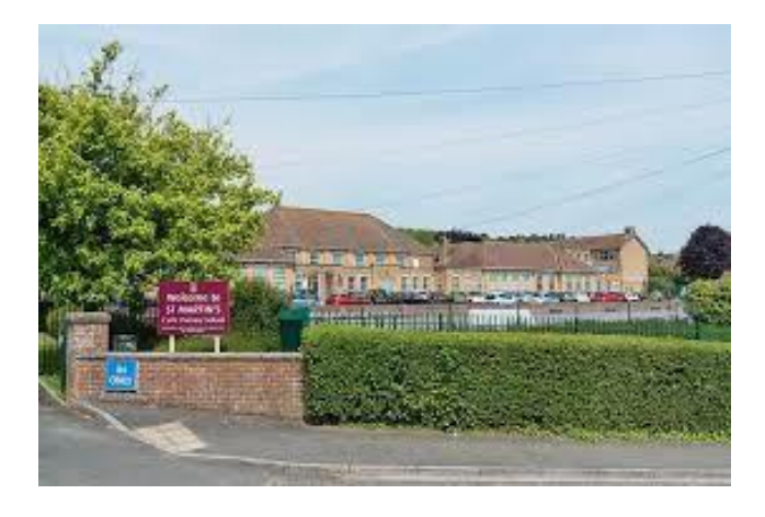
St Martin's Primary School – Church Link school with Foundation governors

There are good relationships between these primary schools and St Martin's, which is enjoyed as a venue for Christmas and Easter school celebrations.