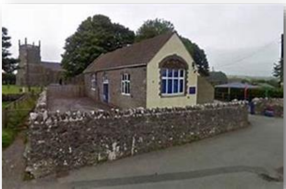
Priddy KS2 Primary School

The Federation has good links with both village churches, with the vicar being a regular visitor. The schools hold regular services throughout the year to celebrate Christian Festivals. One of their aims is to provide a happy, caring and secure learning environment based on Christian values.