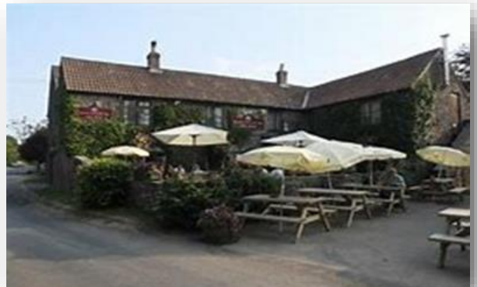
The Queen Vic

We also have a popular and busy Village Hall in the same area as the church and the village school.