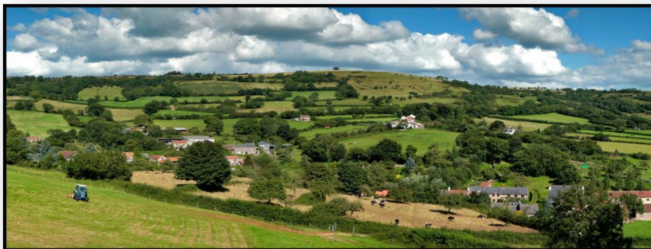
View over Westbury-sub-Mendip

https://www.achurchnearyou.com/church/10872/