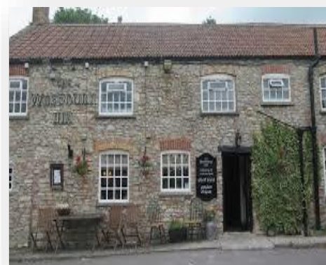
The Westbury Inn

Monthly Church Lunch in the pub after Sunday service.