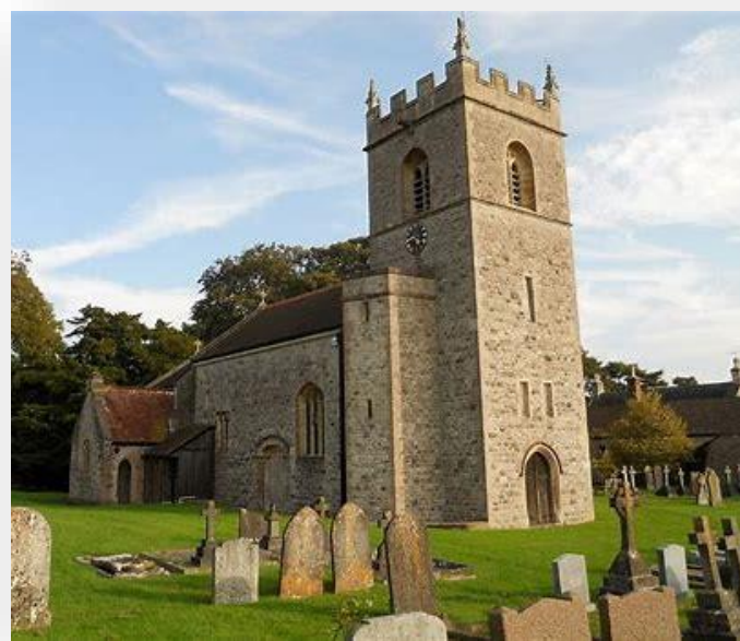
Church of St Lawrence

We have regular support from the local retired Clergy and two Readers. There is also an active Churchwarden.